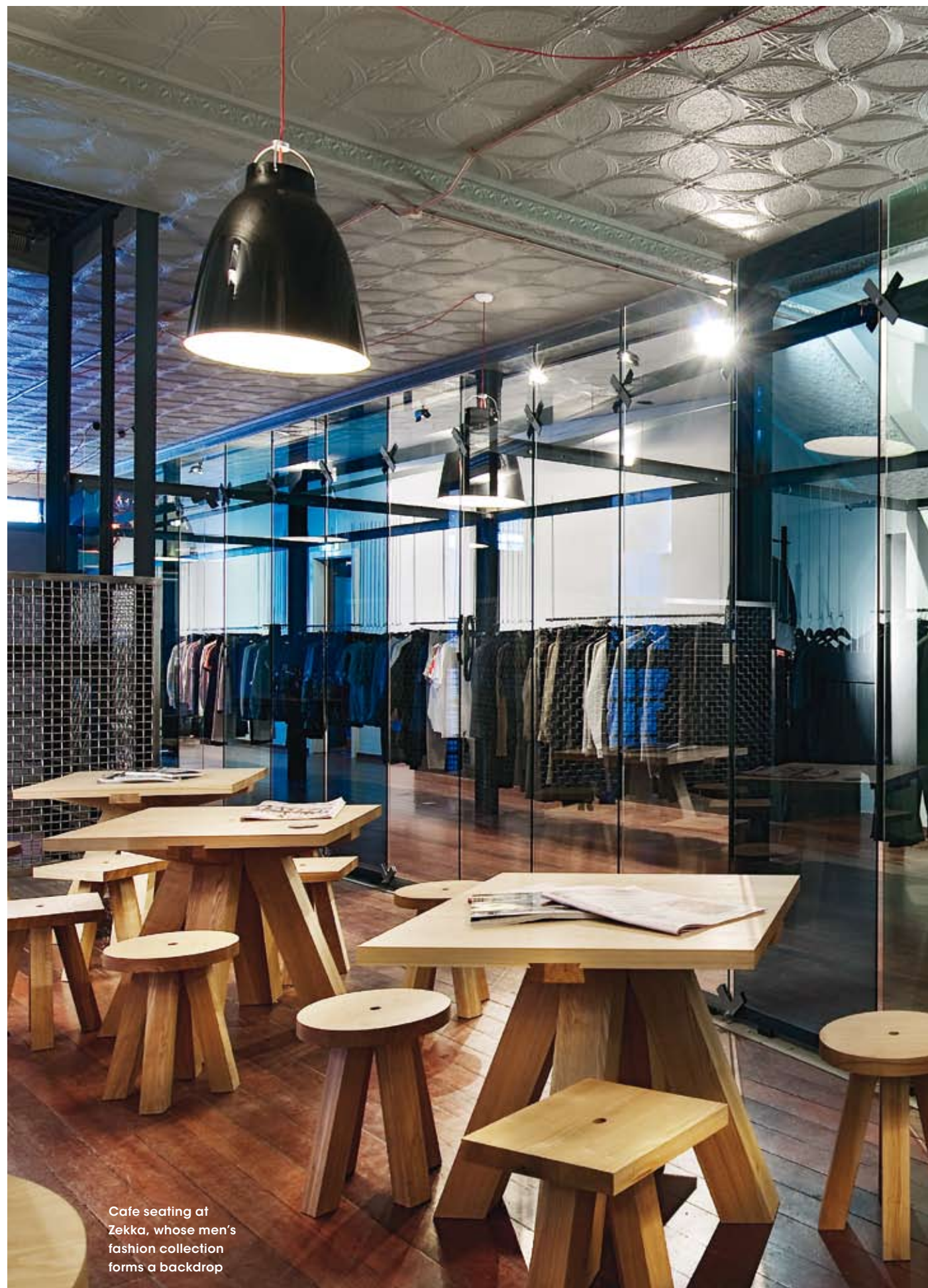
Cafe seating at Zekka, whose men's fashion collection forms a backdrop