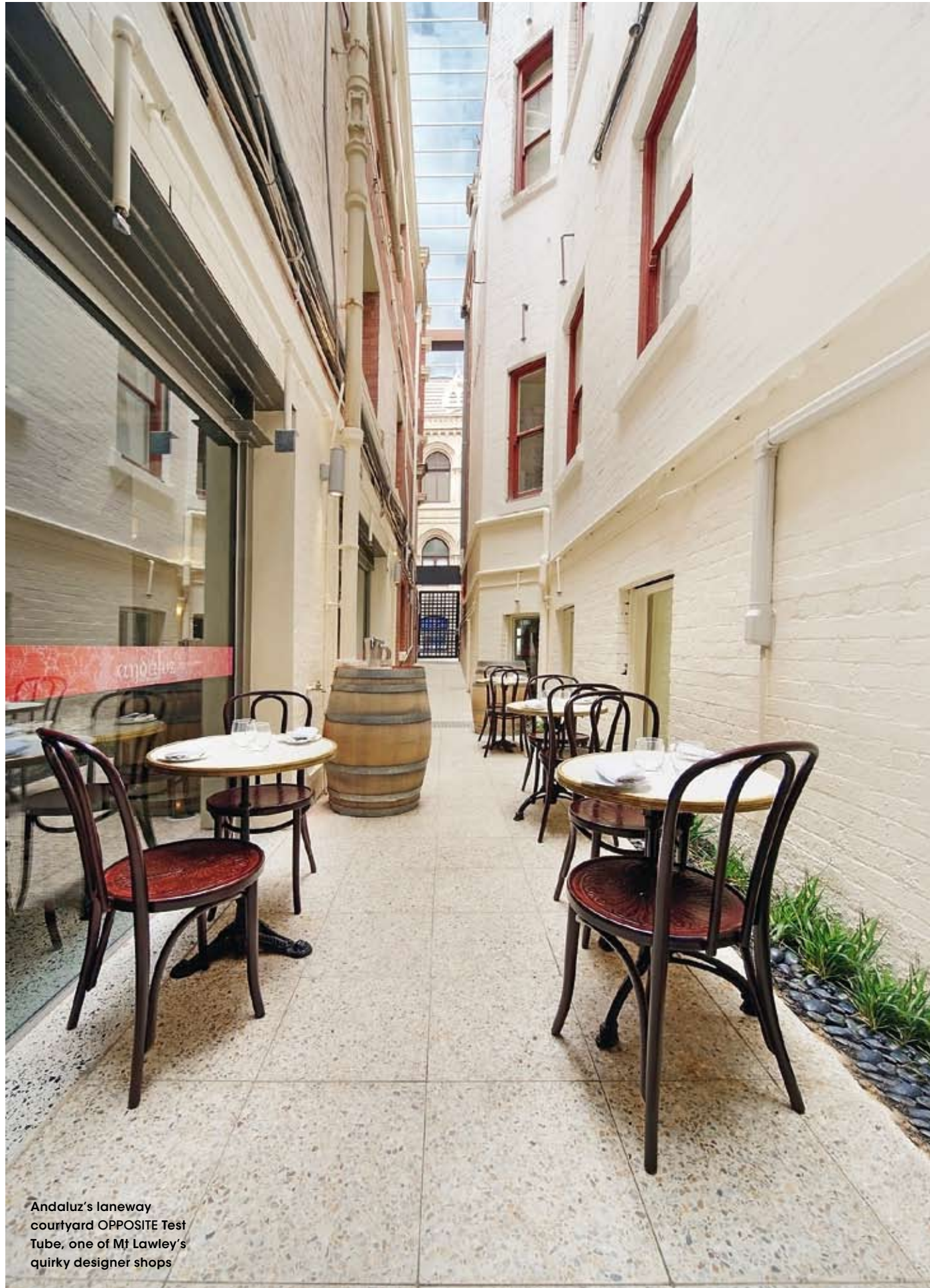
Andaluz's laneway courtyard OPPOSITE Test Tube, one of Mt Lawley's quirky designer shops