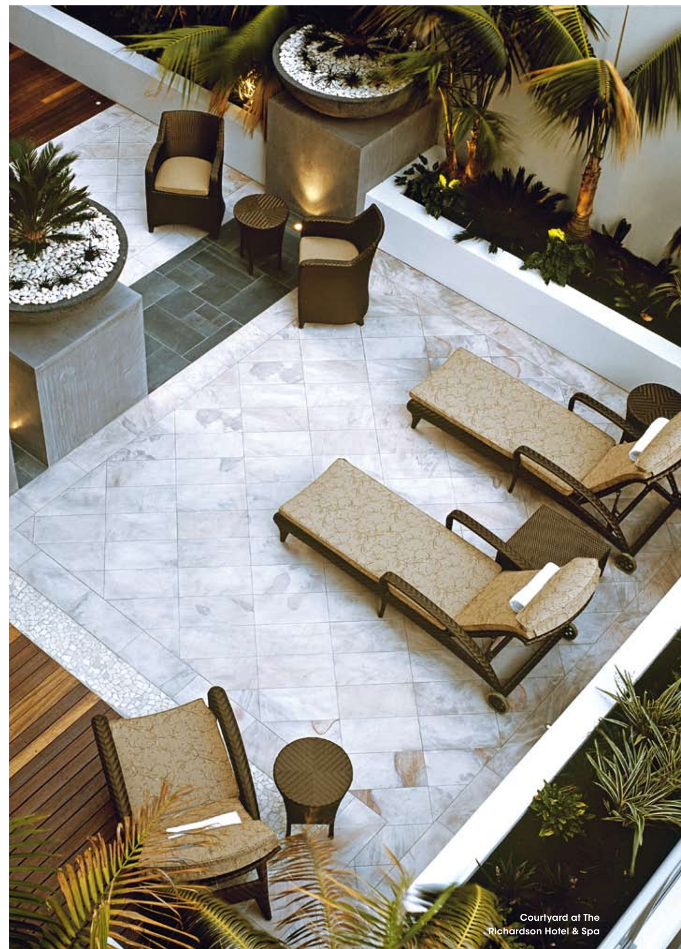
Courtyard at The Richardson Hotel & Spa